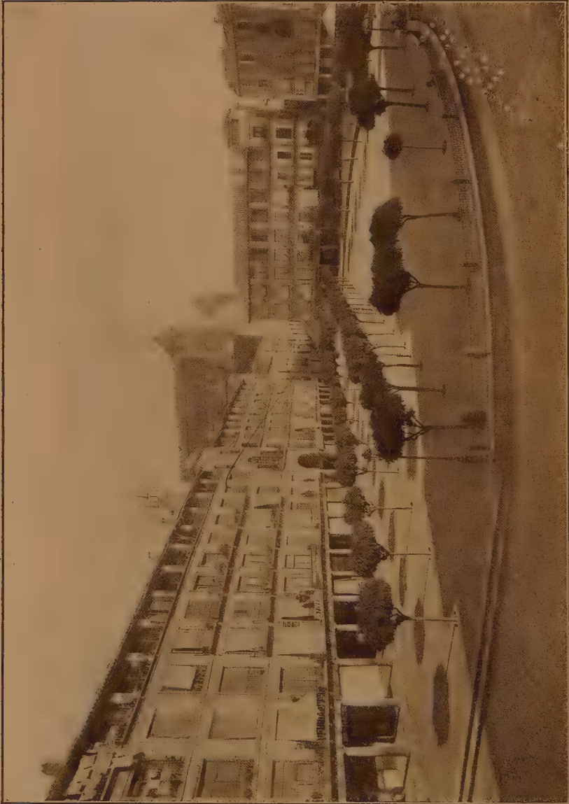
A CITY SQUARE, TOLEDO